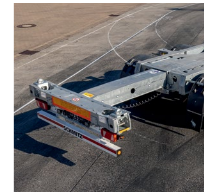
New: Damped rear extension moves pneumatically to the selected locking position and brakes gently.