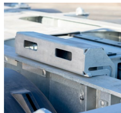
Three pairs of folding container supports* for containers without a tunnel.