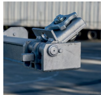
Folding latch as PIN locking device for tunnel containers on the front beam.