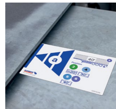
New operating concept with loading plan and clear function and warning notices on locks and extensions .