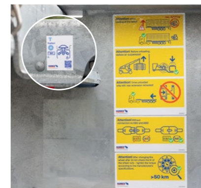
New labelling on locks and extensions for reliable identification of the different loading positions, supported by a loading plan and operating videos via QR code.