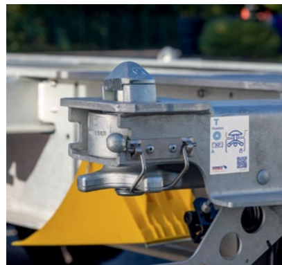
Twist locks with protection against twisting on four pairs of container beams as standard locking system.