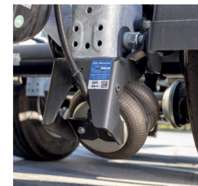
The lift axle* as a starting aid extends the wheelbase and increases the pressure on the drive axle. Unloaded, the lifted position reduces tyre wear.