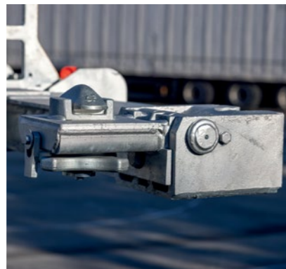
Folding lock on the rigid front beam in the twist lock position .