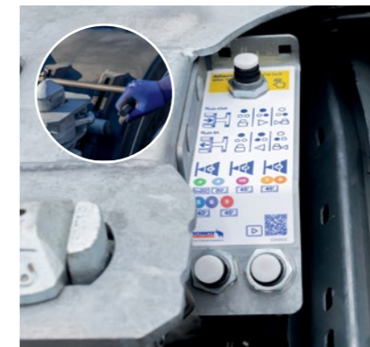
Control unit for pneumatic locking for the rear extension, optionally with manual locking*.