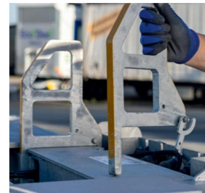
Easily replaceable container guides for containers on the front beam.