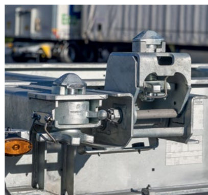
With 2 x 20' loads, the height-adjustable KLAPP LOCK takes over the locking of the front container.