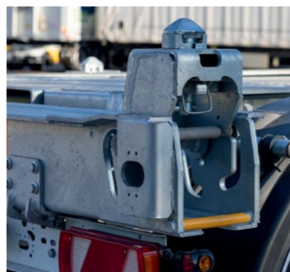
The height-adjustable STEP LOCK® on the rear extension allows 40' and 45' containers to be picked up without a tunnel in two simple steps.